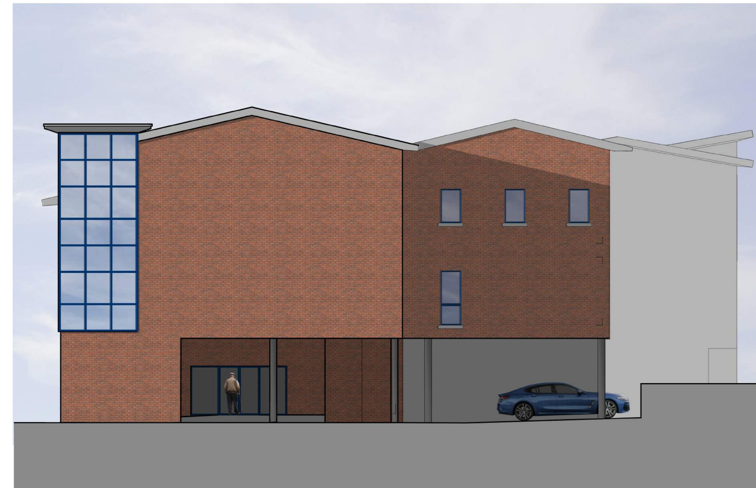
Proposed End Elevation (North East)