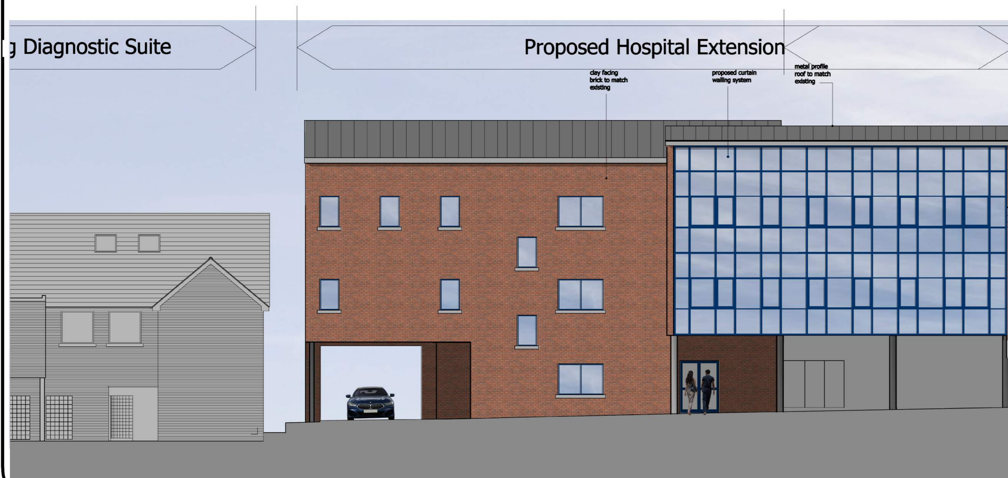
Proposed Elevation to Railway Line (North West)